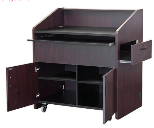
Flat Top Shown

New Feature: Top rear removable, intended to easily be mounted in a wedge position or as flat large work surface, that can support monitors laptops and room control systems.